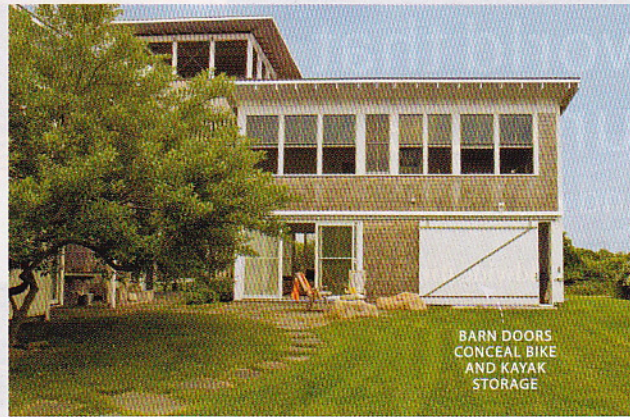
BARN DOORS CONCEAL BIKE AND KAYAK STORAGE

deck offers prime sunset views; exaggerated eaves shade that side of the house from harsh afternoon light. Most of the large windows face west and south, which keeps interiors warm year-round.